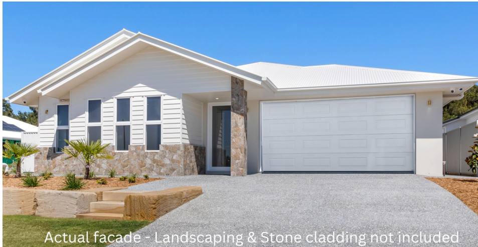
Actual facade - Landscaping & Stone cladding not included