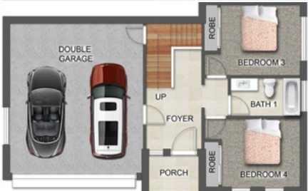
Total - 280m2