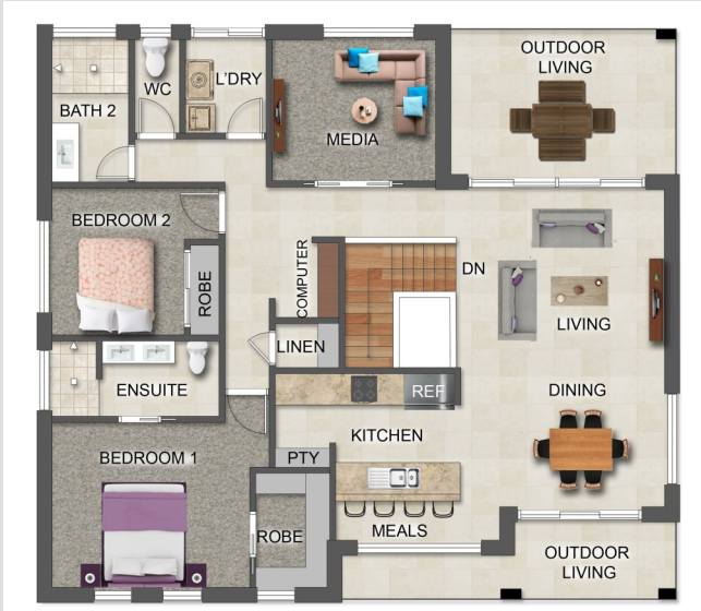
First Floor Layout